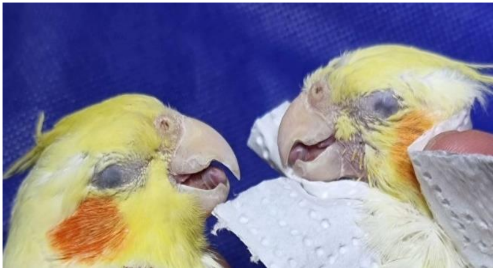
Figure 1. Two four-month-old same-hatch and gender-unknown Lutino Cockatiel ( Nymphicus hollandicus ) with bilateral congenital cryptophthalmos.

Each bird was induced using a XXXS mask and an oxygen flow of 1.5 L/min and 2 MAC isoflurane. Then, they were intubated with an angicath as tracheal tube (Figure 4). Anesthesia was maintained with 1.5 MAC isoflurane using a T-Y Ayres closed breathing system. The oxygen flowmeter was set at approximately 1 L/min during this process. The eye surface was cleaned using betadine scrub 7.5%. An incision was made on both eyelids with the help of Metzenbaum scissors to prevent eye damage. After surgery, both birds were successfully recovered. Eye movement around, pupil response, and opening and closing of the third eyelid indicated healthy vision for both birds. To prevent eyelids from closing again, causing infection and dry eyes; artificial tear drops (Tearlose®, Sina Darou, Iran) every 30 minutes for 48 hours, ciprofloxacin eye drop 0.3% (Ciplex®, Sina Darou, Iran) one drop in each eye every 3 hours for up to 10 days, prednisolone acetate eye drops 1% (Precord®, Sina Darou, Iran) every 6 hours one drop in each eye for up to 4 days and vitamin A ointment (Xerovit®, Sina Darou, Iran) every 12 hours in each eye for up to 7 days was used. Clinical follow-ups within three weeks after the surgery, the edges of the eyelid were entirely repaired, and the complication did not recur (Figure 5).