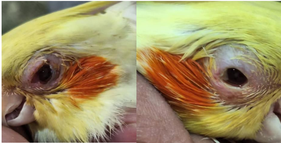
Figure 5. Appearance of the eyes in both birds 3 weeks after surgery. The edges of the eyelid were entirely repaired and the complication did not recur.