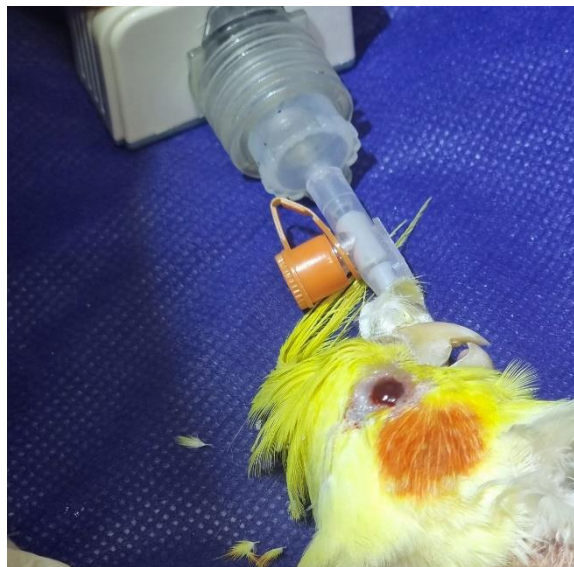
Figure 4. Both birds were intubated with an angicath as a tracheal tube